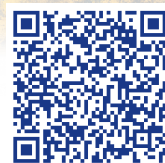
Scan the code to visit us online!

Tap into an authentic, connected, and emotionally tuned-in leadership mindset that boosts commitment to achieving professional visions and personal goals. This program is designed to honor diverse perspectives, promote mindfulness, and cultivate leadership styles rooted in emotional intelligence and cultural awareness.